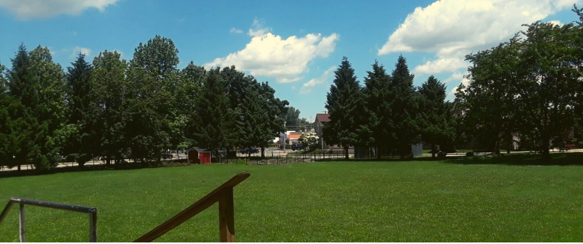
The Site Plan