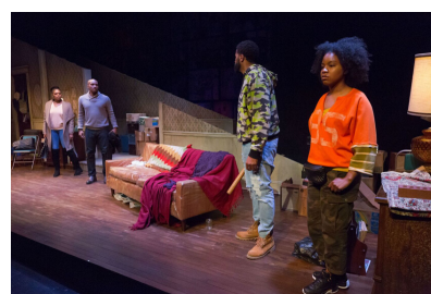
Mud Row play

Two generations of sisters protect and defy the legacy of their fore-mothers in this riveting, funny, and ultimately hopeful world premiere play set in, and inspired by, the East End of West Chester, PA.